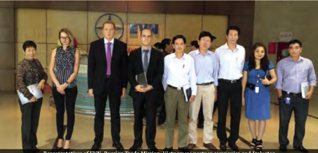
Representatives of EVN, Russian Trade Mission, Vietnamese partner companies and Izolyator

GDP growth rate increasing share of service sectors